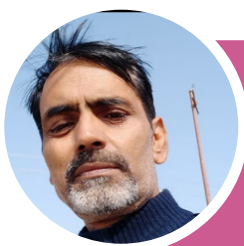
SHREE NIWAS CHATURVEDI Centre for Aptitude Analysis and Talent Search, India